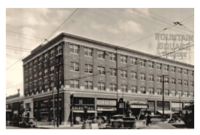
The Fountain Square Theatre Building was completed May 4, 1928. The building is referred to as "the Big Light on the Avenue."

Fountain Square Theatre Building: On the corner of two major thoroughfares, the Fountain Square Theatre Building has gone through numerous iterations: a vaudeville and movie theater with bowling on its fourth floor from 1928-1957, a Woolworths in the 1960s, and from the 1970s until the early 1990s, a thrift shop, used furniture store, and vacant upper-level office spaces. Extensive renovations by owners Linton and Fern Calvert began in 1993 with restoration of its fourth floor bowling alley, even reclaiming vintage duckpin bowling equipment found in an old barn in Columbia City, Indianapolis.9 Today the building has a theater with a 40-foot domed ceiling that once again features twinkling stars, a mezzanine level that retains much of its original architectural detail<sup>10</sup> and meeting space, a boutique inn, and restaurants and bars.