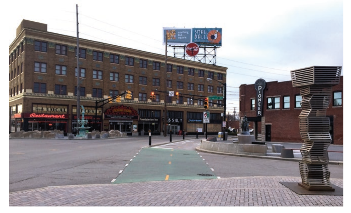
The Cultural Trail runs past the Fountain Square Theatre Building.

Walk around the blocks at the commercial center of Indianapolis's Fountain Square neighborhood<sup>1</sup> on any given evening and you might stumble across an album release show at Radio Radio, the in-house burlesque troupe at White Rabbit Cabaret, or a bluegrass jam at Arthur's Music Store. You can stop on your route to savor artisan chocolates, enjoy a cold craft beer, or witness a man snore over his eggs at a greasy 24-hour diner.