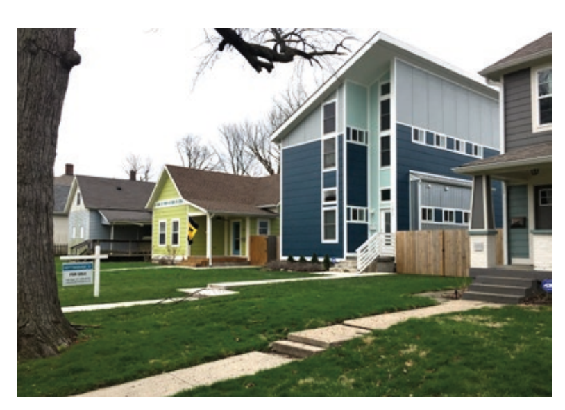
New and old housing stock juxtaposed in Fountain Square.

complementary businesses, such as nightclubs, restaurants, and bars.<sup>42</sup> Even today, Heartland Film's Adam Howell points to First Friday traffic as the "biggest advantage" for Fountain Square businesses,<sup>43</sup> while Von Deylen credits Fountain Square's strategic embrace of music as a key reason for Fountain Square's recent burst of economic activity.<sup>44</sup> Regardless, the lure of specific times to enjoy arts and entertainment in the community clearly pulled in customers for area businesses.