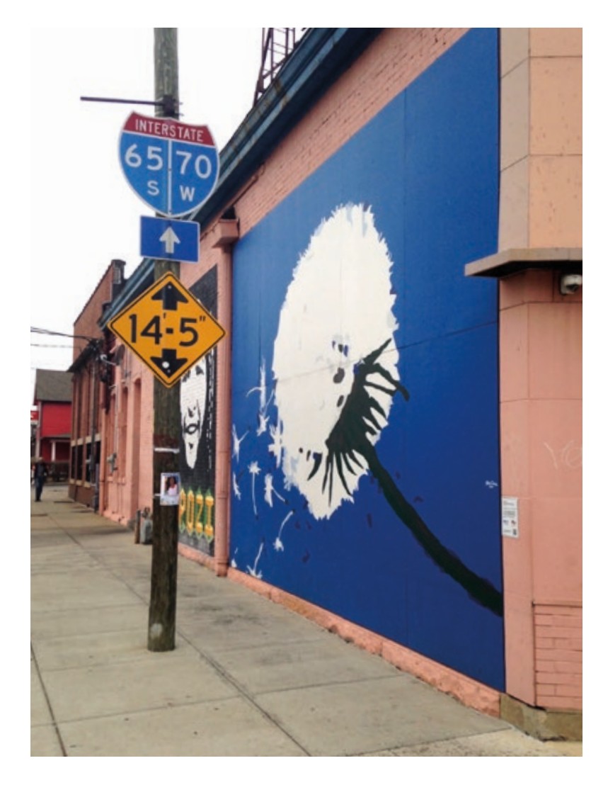
Fountain Square murals. Background mural titled Mpozi after its subject, an Indianapolis photojournalist who died suddenly in 2006 at the age of 34. Foreground mural titled Weeds ?, part of the Lilly Oncology on Canvas series.

The Cultural Trail "healed the cut" that I-65/70's construction introduced, linking Fountain Square to downtown and other cultural districts and prioritizes landscape/ streetscape design elements.